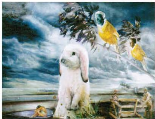
Konferenz der Echos, 2004