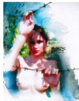
Untitled (462Megirlo8/03), 2003

"Check out Martin Eder's sick dogs and malevolent kittens. No wonder he's so hot." (Time Magazine)